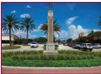
Rendering of new roundabout at North end of San Marco Square