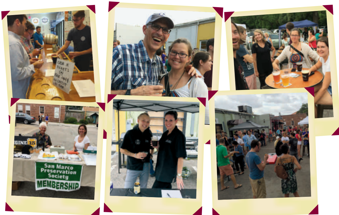
Scenes from a successful San Marco Nights event at Beer:30 in San Marco this summer.