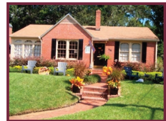
2747 Fieldston Ln