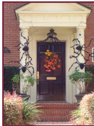
2640 River Rd