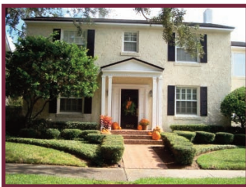
1002 Balis Pl.