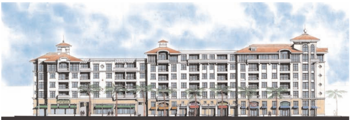
2 NORTH ELEVATION

According to the developers, the project will require approval from the city which is expected to take approximately three months. Once approved, construction will take approximately 18 months to completion.