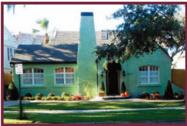
1055 Sorrento Rd