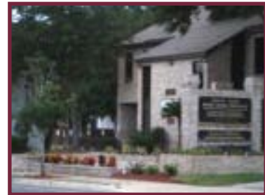
1837 Hendricks Ave.