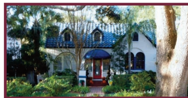
1027 Sorrento Rd

Be on the lookout in the SMPS Landscape signs in your neighborhood and be sure to recognize award recipients for all their hard work in keeping our neighborhood looking so beautiful!