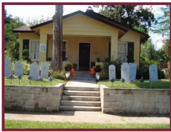
2720 Fieldston Ln

The most recent group of award recipients did an exceptional job of showing their fall colors. Please join us in congratulating the following recipients of the Fall Season Landscape Awards: